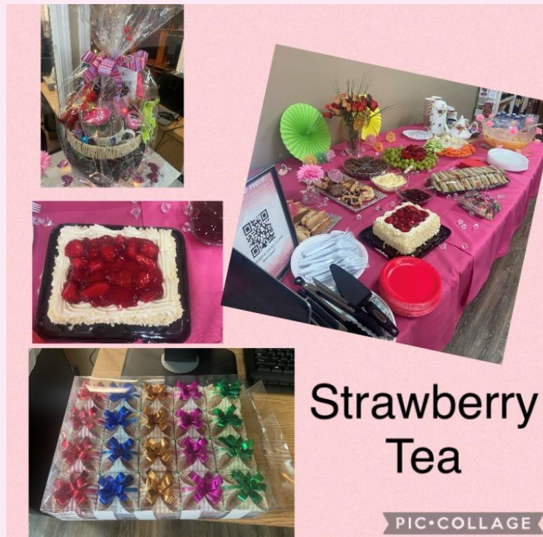
Photos from the Strawberry Tea