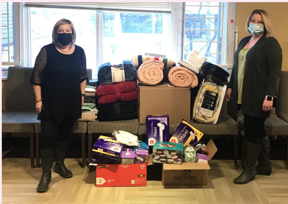
Donated items for a local Women's Shelter

Throughout November, the ICWA team collected donated items for a local second-stage Shelter for women and their children. Items collected included: towels, blankets, sheet sets, comforters, and feminine hygiene products. Thanks to all those who contributed to this worthwhile cause.