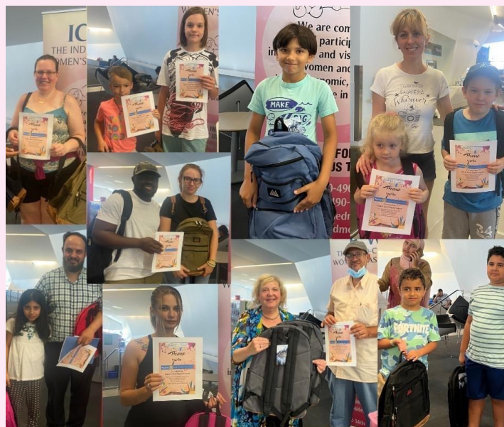
Sample of families receiving Back Packs in August 2022