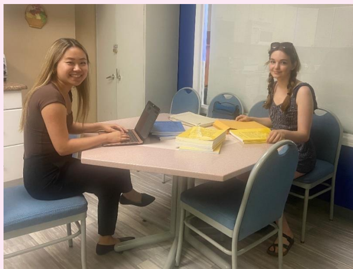
Students Distributing the Family Guidebook for Recent Immigrants