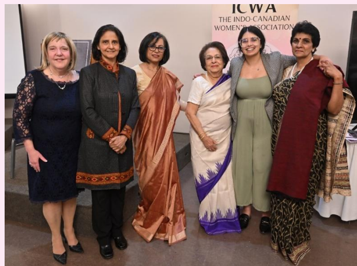
Board Photo from the IWD event:

Thanks to all our 2023 sponsors and donors for making this event a resounding success!