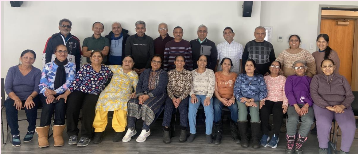
Some of the participants who attended the Indigenous People's Experience

The educational experience is just the beginning for the South Asian community to understand and empathize with the indigenous population, including the importance of responding to the Calls to Action. ICWA looks forward to hosting future events for the community to learn about Canada and grow in knowledge and education.