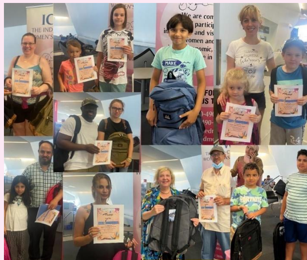
Sample of families receiving Back Packs in August 2022