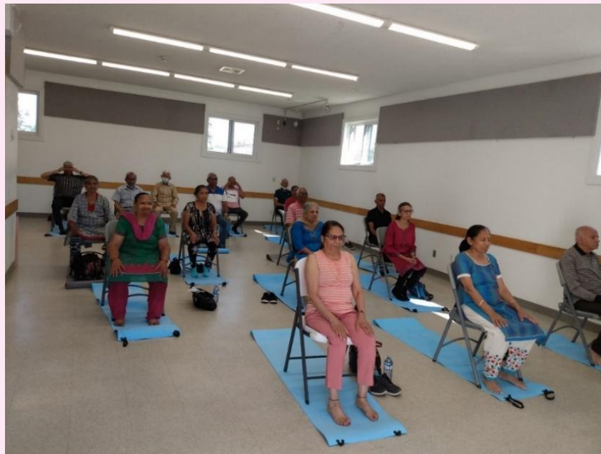
Seniors Yoga Session

There was a weekly session of fun, wellness and information for the seniors from July to November 2022. In total 70 unique seniors participated in different sessions, and we received positive feedback from clients. Thanks as well for the funding received by the Edmonton Public Teachers and the Yoga Association of Alberta for providing for the yoga teachers.