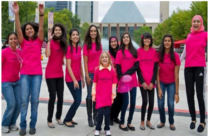
ICWA's youth group at the Daughter's Day celebration

Thanks to the efforts of Daughter's Day team, September 1<sup>st</sup>, 2012 was proclaimed as the Daughter's Day by Mayor Mandel on behalf of the City of Edmonton. Planning for 2013 Daughter's Day celebrations are currently underway.