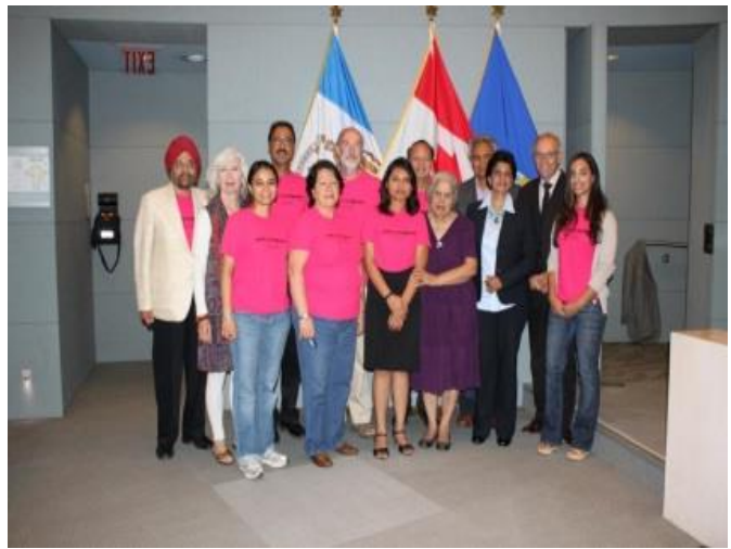
Daughter's Day team at City Hall