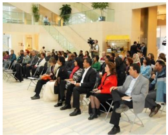
Attendees at the memorial gathering

To condemn this dreadful crime and show solidarity, ICWA held a memorial gathering on February 15th 2013. Various members of the community, Government representative and members of various organizations expressed grief and solidarity in combating the violence against women.